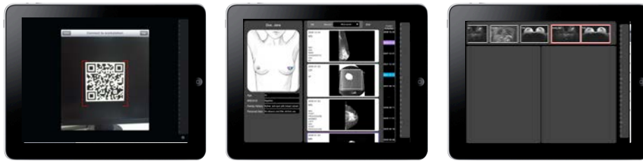
Figure 3: Mobile device screens: Reading the QR code (left), the patient browser interface (middle), and the mobile device user interface during reading (right). MR images are displayed on the primary display (see Fig. 2).