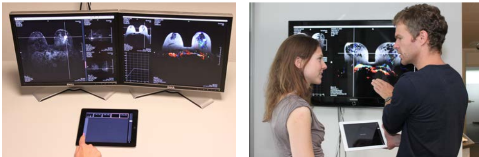
Figure 1: Pairing a mobile device with a workstation (left) or a large screen for diagnostic reading (right)

All diagnostically relevant image data will be presented on large, calibrated screens. The mobile device may display secondary information, such as anamnesis, patient history, genetic predisposition and even control the patient selection but is never used to display patient images for diagnostics. Interaction with the data is controlled via multi-touch gestures on the multi-touch tablet or smartphone. We will show some new approaches that go beyond the limits of mouse and keyboard and demonstrate the potential for increased interaction performance. The concept is applied to diagnostic reading of breast MRI series, however, potential applications spread beyond.